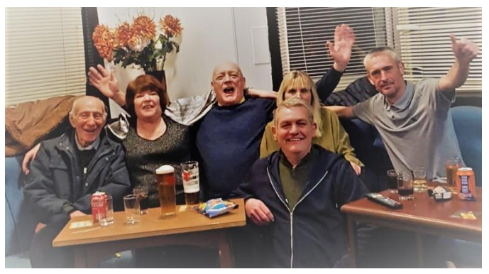
Some of our regulars bringing in the New Year – cheers to you all!

The club stayed open over the festive period, much to the delight of the weekend regulars who enjoy putting the world to rights over a pint or two.