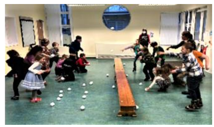
Elphinstone Primary wishes everyone a Merry Christmas and Happy New Year.

P1-4 had a special visit from Santa and were delighted with their early Christmas presents. They also had fun at their Christmas party, even enjoying an indoor snowball fight.